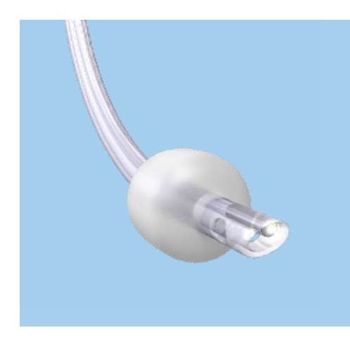
Ambu® VivaSight™ 2 SLT