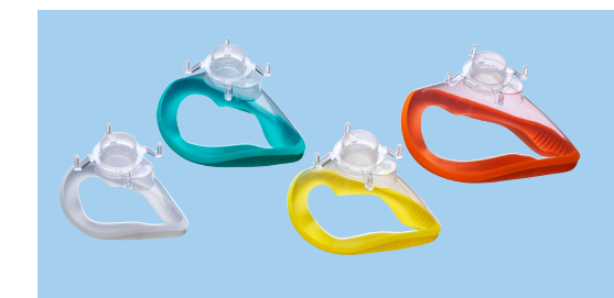
Ambu® Disposable Open Cuff Face Mask sizes 3, 4, 5, 6