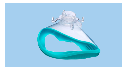
Ambu<sup>®</sup> Disposable Open Cuff Face Mask