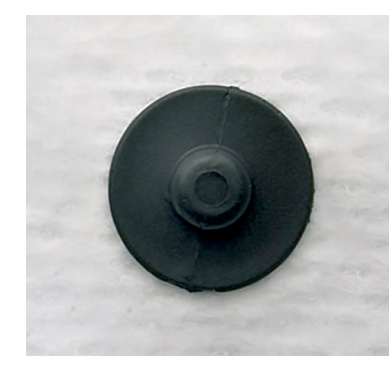
S/RT = Graphite Stud