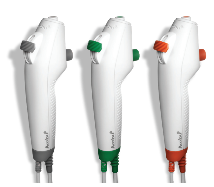
aScope 4 Broncho Slim 3.8/1.2 180°/180°

- Includes three sizes for multiple procedures and the aScope BronchoSampler, a tailor-made solution that helps simplify the sampling process