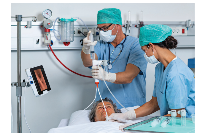
aScope 4 Broncho Large 5.8/2.8