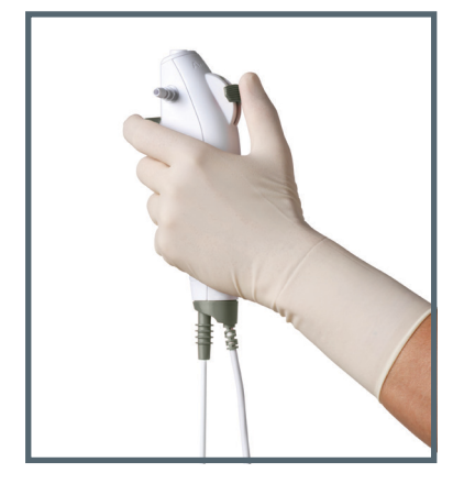
Ergonomic and lightweight handle designed to give you a firm and comfortable grip