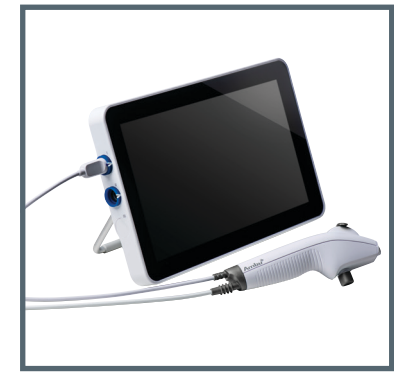
Ambu aScope 4 Broncho Slim and Ambu aView 2 Advance