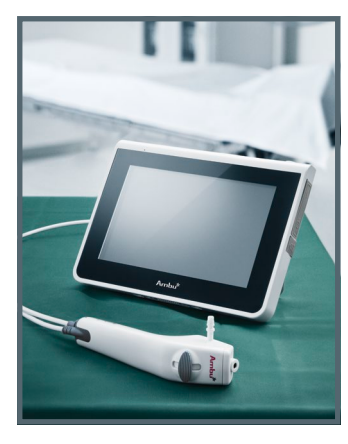
Ambu® aScope™ 3 Slim and Ambu® aView™