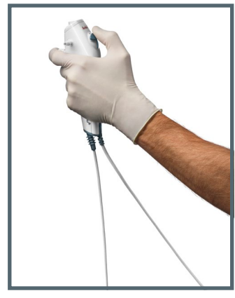
Ergonomic and lightweight handle designed for optimal user comfort