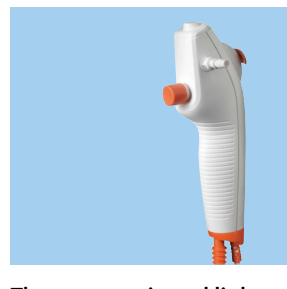
The ergonomic and lightweight handle is designed to give you a firm and comfortable grip