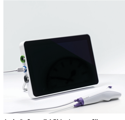
Ambu® aScope ^{\text{™}} 4 RhinoLaryngo Slim and Ambu® aView ^{\text{™}} 2 Advance