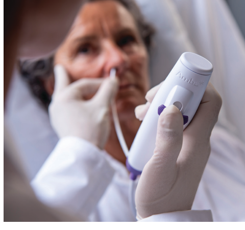
aScope ^{\mathsf{M}} 4 RhinoLaryngo Slim is always comfortable to hold thanks to its lightweight and ergonomic design