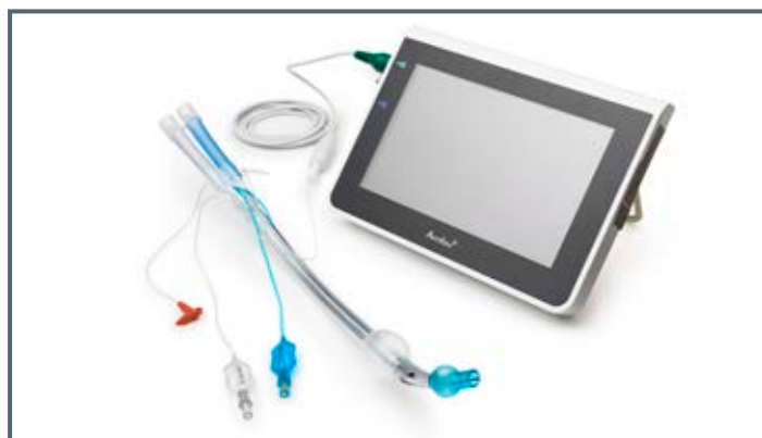
VivaSight-DL connected to Ambu® aView™ monitor

Manufactured by ETView Ltd. Catom 2 Street Misgav Business Park M.P. Misgav 2017900 Israel