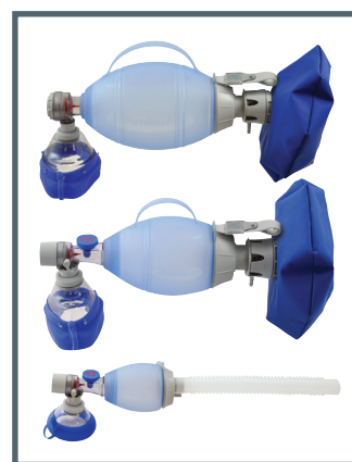
Ambu Silicone Face Mask connected to Ambu Oval Plus Silicone resuscitators