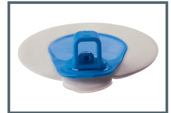
A = 4 mm fitting