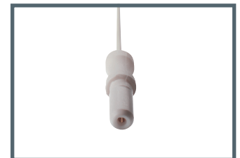
K = 1.5 mm connector

Ambu A/S Baltorpbakken 13 DK - 2750 Ballerup Denmark Tel. +45 7225 2000 Fax +45 7225 2053 www.ambu.com