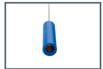
A = 4 mm connector