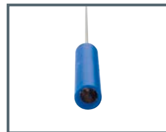
A = 4 mm connector