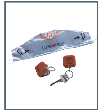
Ambu LifeKey unfolded