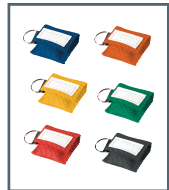
Ambu LifeKey private label