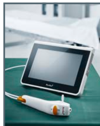
Ambu® aScope™ 3 Large and Ambu® aView™