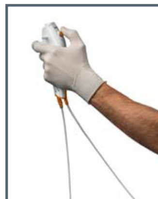
The ergonomic and lightweight handle is designed for optimal user comfort