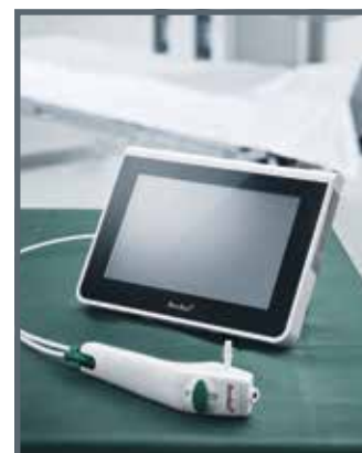
Ambu® aScope™ 3 Regular and Ambu® aView™