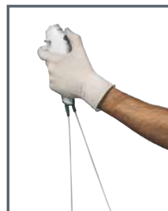
The ergonomic and lightweight handle is designed for optimal user comfort