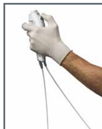
Ergonomic and lightweight handle designed for optimal user comfort