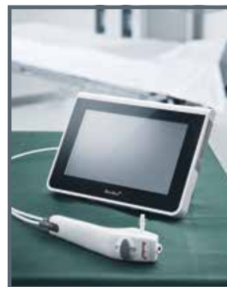
Ambu® aScope™ 3 Slim and Ambu® aView™