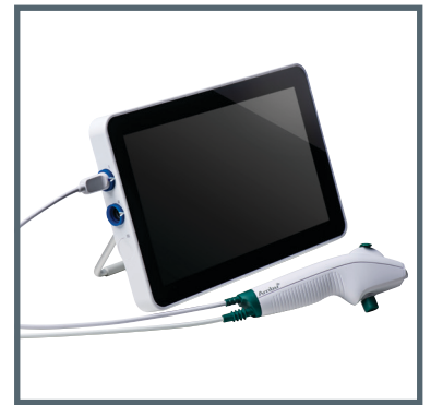
Ambu aScope 4 Broncho Regular and Ambu aView 2 Advance