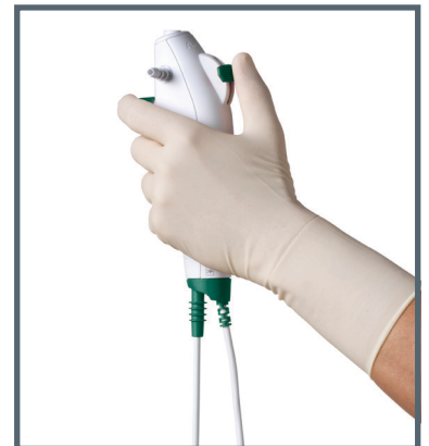
The ergonomic and lightweight handle is designed to give you a firm and comfortable grip