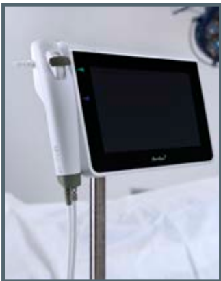
Ambu® aScope™ 4 Broncho Slim and Ambu® aView™