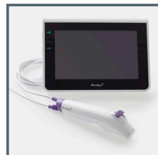
Ambu® aScope™ 4 RhinoLaryngo Slim and Ambu® aView™