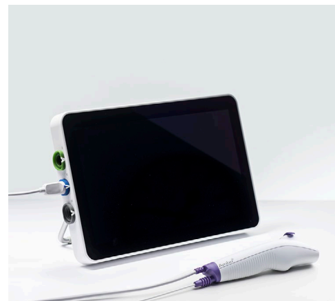
Ambu® aScope™ 4 RhinoLaryngo Slim and Ambu® aView™ 2 Advance

Learn more about Ambu's sustainability initiatives: https://www.ambu.com/endoscopy/single-use-endoscopy/environment