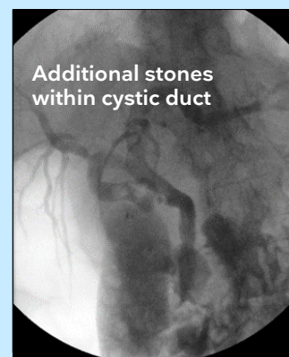
Figure 3: Fluoroscopy showing additional stones within the abnormally draining cystic duct.

The balloon catheter was advanced through the cystic duct into the gallbladder aided by guide wire, but attempts at stone removal failed. The stones were then pushed into the gallbladder by flushing the cystic duct with saline.