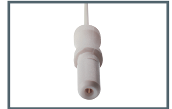
K = 1,5 mm connector