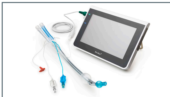
VivaSight-DL connected to Ambu® aView™ monitor

Manufactured by ETView Ltd. Catom 2 Street Misgav Business Park M.P. Misgav 2017900 Israel