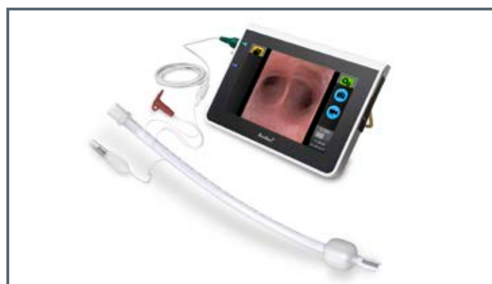
VivaSight-SL connected to Ambu® aView™ monitor

Manufactured by ETView Ltd. Catom 2 Street Misgav Business Park M.P. Misgav 2017900 Israel