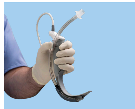
The channelled hyper-angulated blades allow for an endotracheal tube to be pre-loaded into the blade prior to intubation