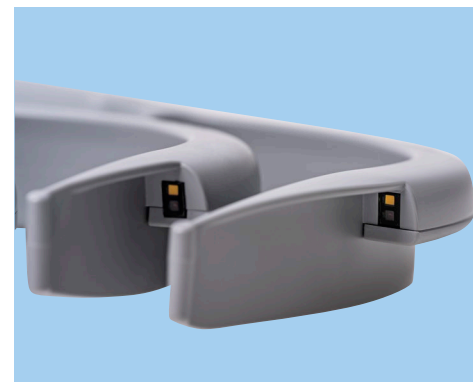
The SureSight blades have an integrated camera and LED

Ambu A/S Baltorpbakken 13 2750 Ballerup Denmark T +45 72 25 20 00 ambu.com