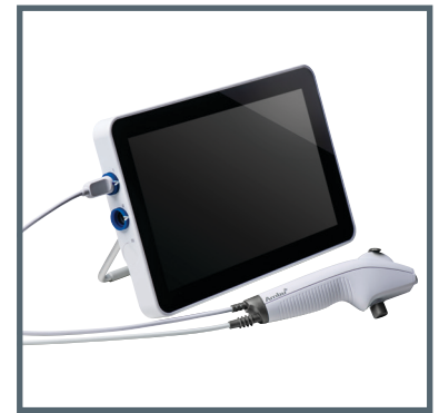
Ambu aScope 4 Broncho Slim and Ambu aView 2 Advance