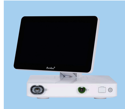
The compatible Ambu aBox 2 display and processing unit

Dual-function configurable buttons for control of key endoscope functions