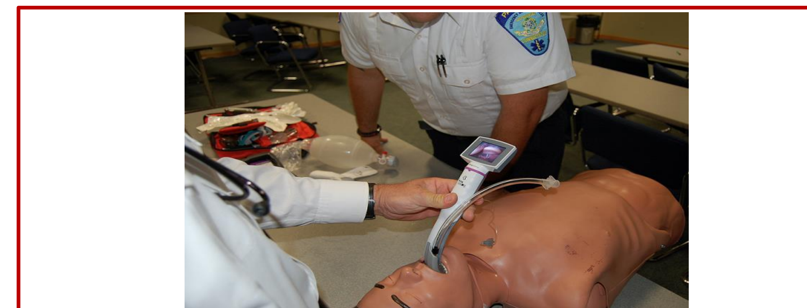
Figure 4. King Vision™ channelled scope inserted in neutral neck position.