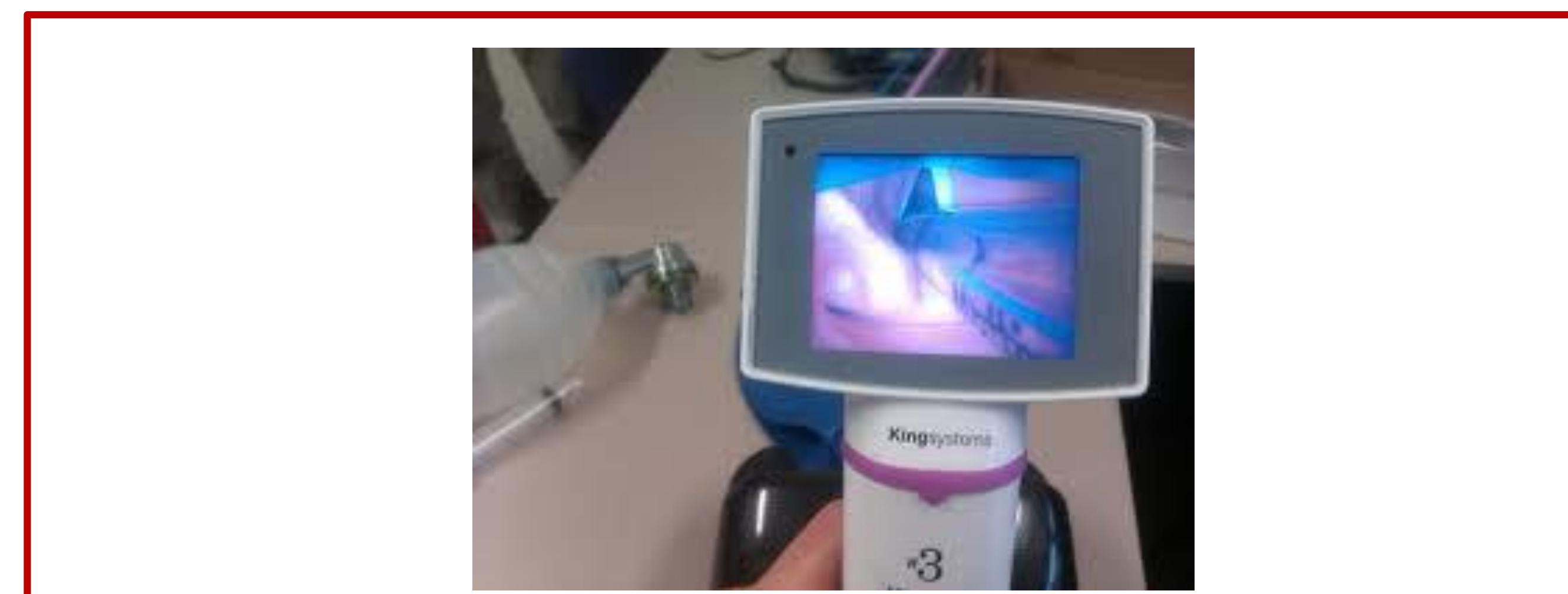
• Figure caption